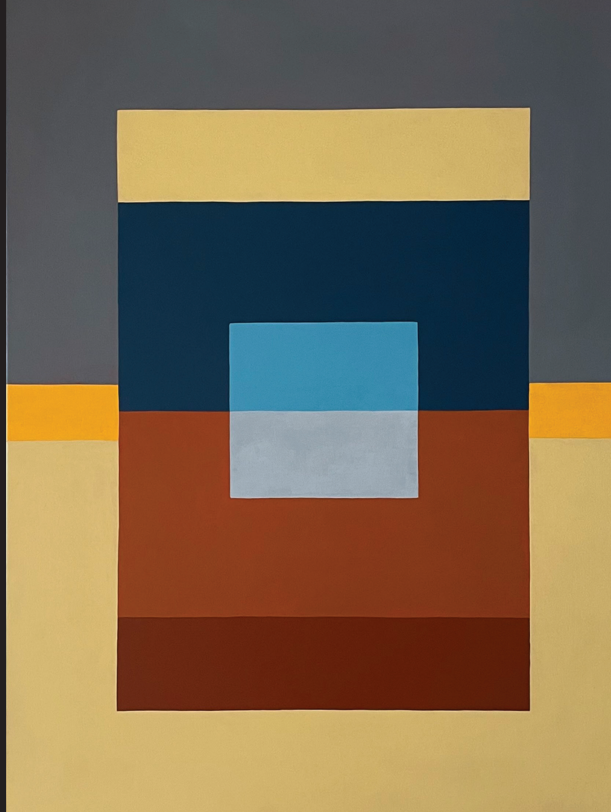
Ces McCully, Untitled 5 , 2023, acrylic on canvas, 75 x 60 cm

In recent years, McCully has exhibited across Australia and Europe.