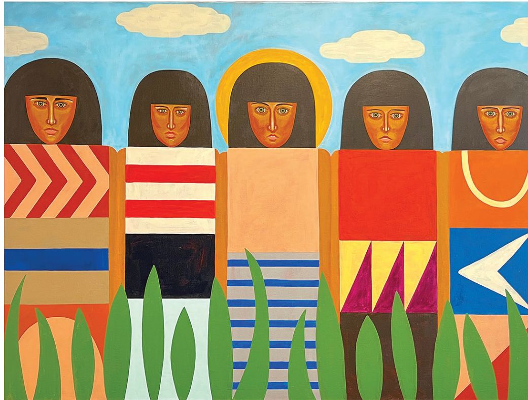
Ces McCully, Mother's Group , 2023, acrylic on canvas, 120 x 160