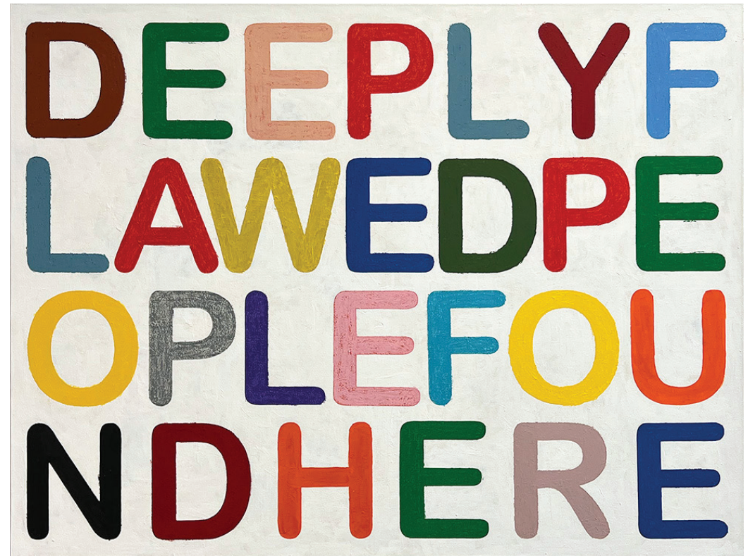
Ces McCully, Deeply Flawed People Found Here , 2023, oil on canvas, 120 x 160 cm