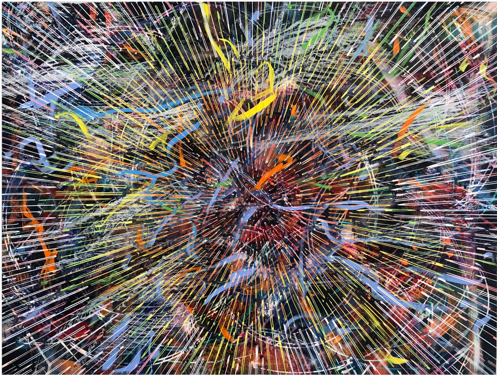
Dreamsong , 2019, oil on paper mounted on canvas, 76.5 x 101.5 cm