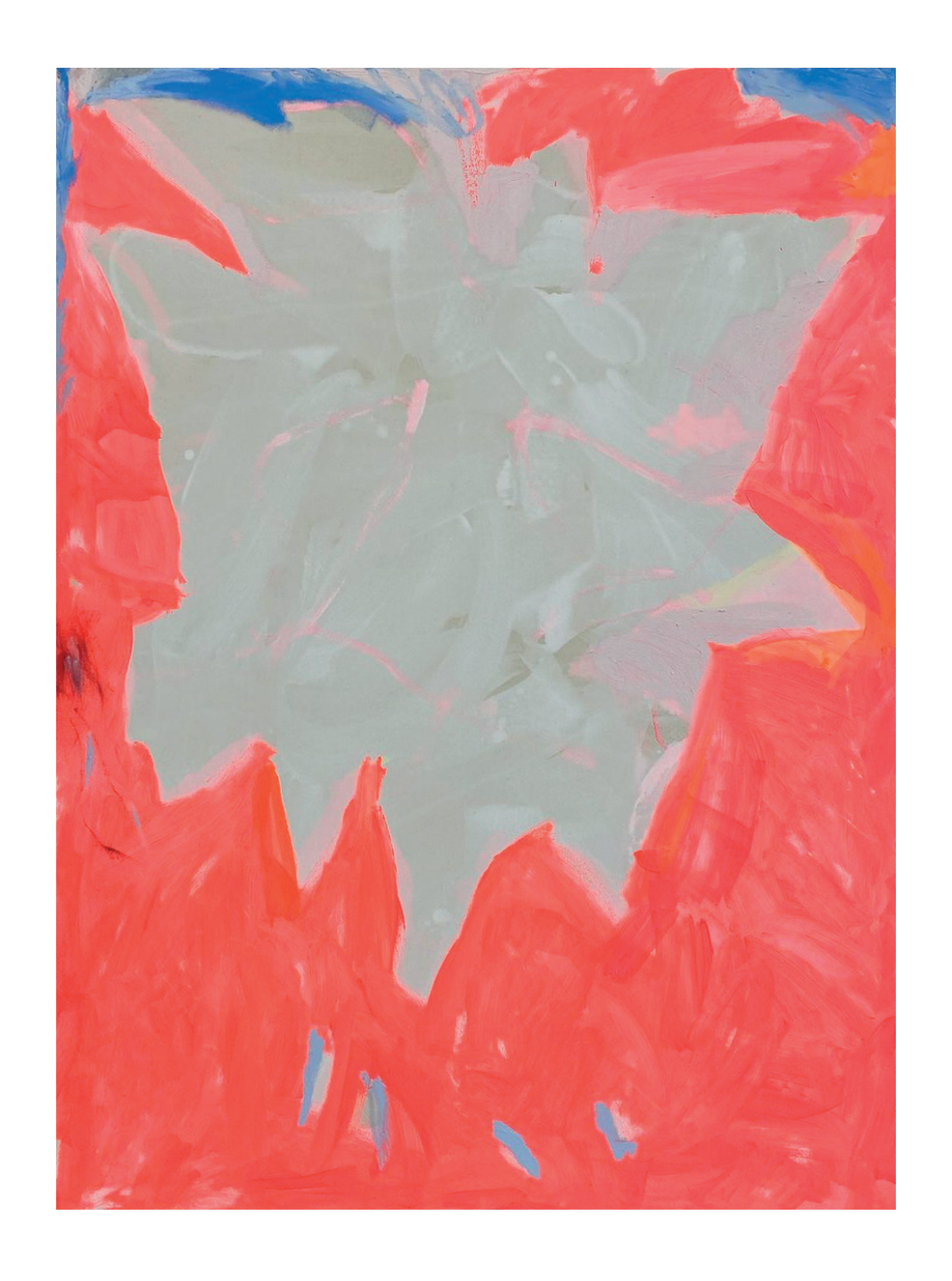
Gabriele Herzog, 'Encore Une Fois', 2022, oil stick, acrylic and gesso on raw cotton canvas, 150 x 110 cm