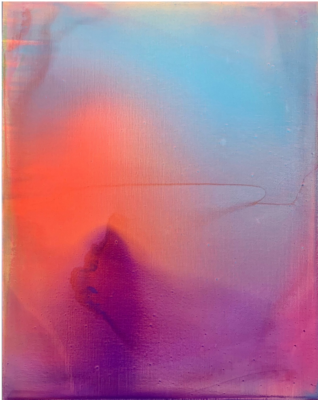
Thorbjørn Bechmann, 'UT1', 2021, oil on canvas, 150 x 120cm