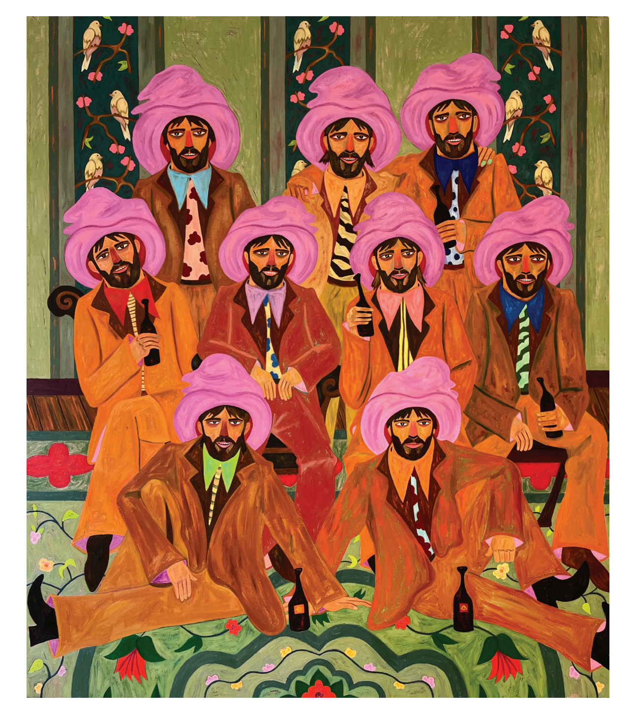
Ben Crase, The Bloom, 2023, oil, oil stick, pigment stick, oil pastel on canvas, 213.4 x 182.9 cm