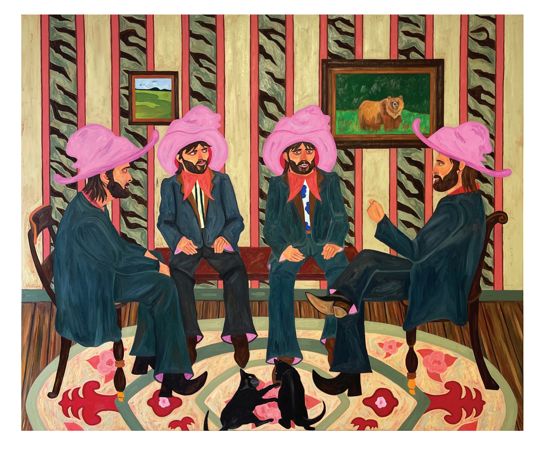
Ben Crase, Around the Ruby , 2023, oil, oil stick, pigment stick, oil pastel on canvas, 183 x 152 cm